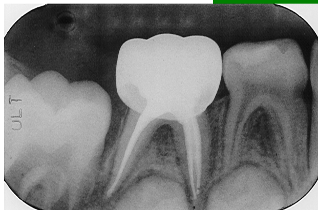
Mandibular right second primary molar shaped with nickel-titanium rotary .04 tapered files and filled with pulpectomy paste.