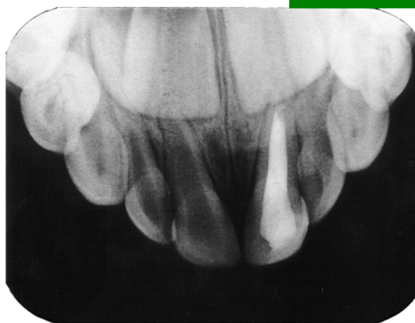
Maxillary left primary central incisor shaped with nickel-titanium rotary .04 tapered files and filled with pulpectomy paste.